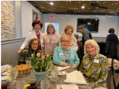
Scenes from our Spring Luncheon at Jackson's!

180 Little Neck Rd, Centerport, NY 11721 (631) 854-5579